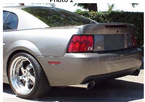
Finished Picture 2