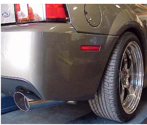
Finished Picture 1