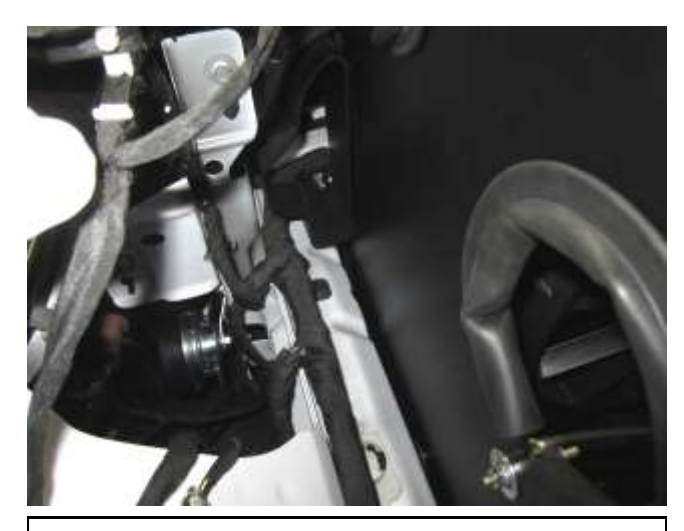
b. Lower the heat shield into the vehicle taking care to align the shield between the fresh air supply and the radiator as shown above.