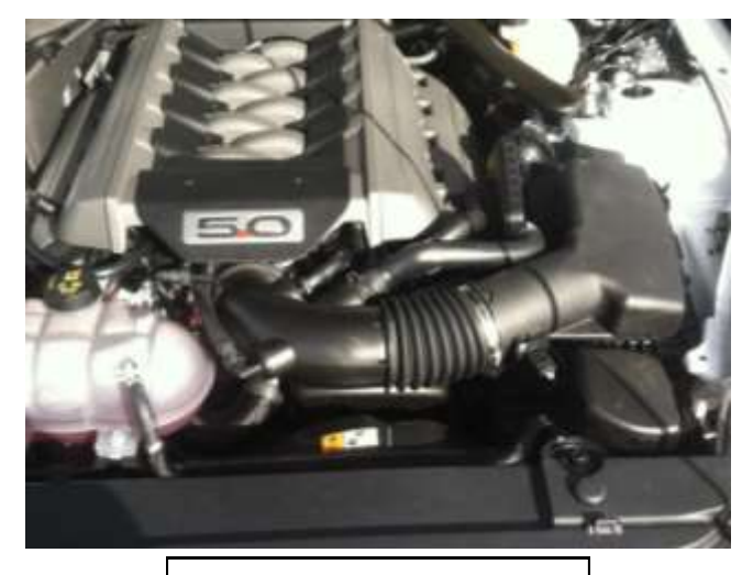
o. Factory air induction system.