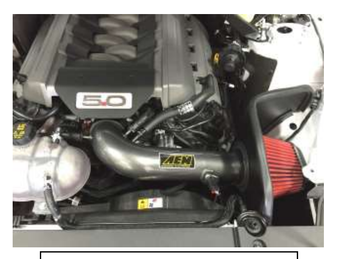
p. Finished installation of AEM Intake System.