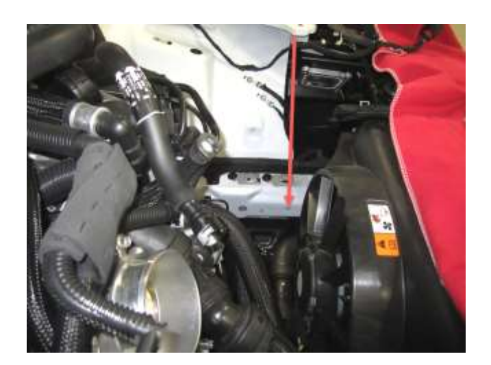
c. Using the bolt & washer assembly as shown on page 2, start the bolt into the threaded hole in the chassis as shown above.