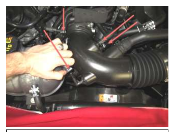
b. Release the three quick disconnect fittings from the factory intake duct and loosen its hose clamp at the throttle body.