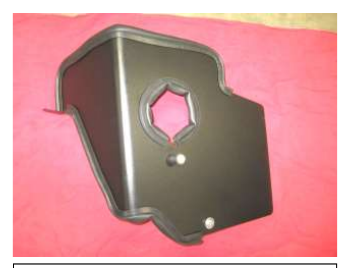
a. Assemble the heat shield according to the exploded view on page 2 of this document as shown including the edge trims & rubber mount below the intake tube hole.

a. When installing the intake system, do not completely tighten the hose clamps or mounting hardware until instructed to do so.