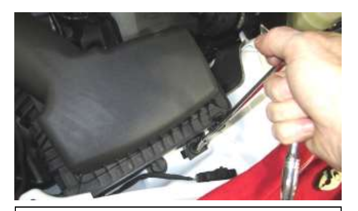
e. Remove the 10mm bolt securing the factory airbox. Ensure that the nut clip does not fall into the fender well.