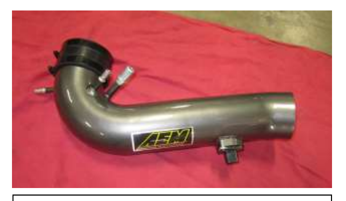
e. Assemble the intake tube components as shown above including the hose, clamps, and MAF sensor.