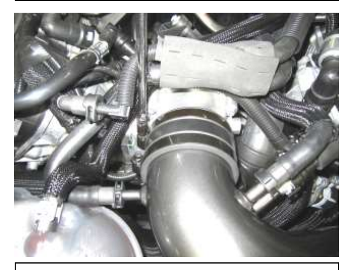
g. Lower the tube into the vehicle aligning the filter end in the heat shield first and then slipping the hose over the throttle body. Push on all lines as shown above until they click on securely. Ensure that wiring harness remains in front of the bracket on the bottom of the tube and reconnect to the MAF sensor.