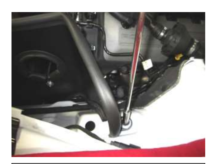
d. Reinstall the factory fastener at the upper mounting tab location of the heat shield.