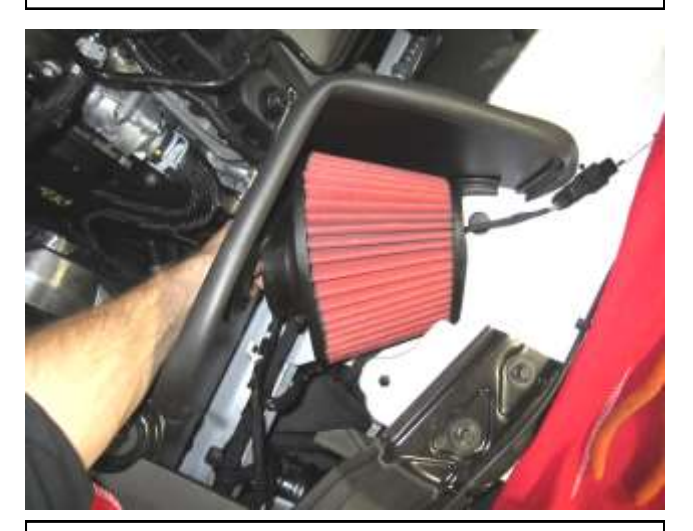
h. Install remaining hose clamp on the filter and lower the filter into the vehicle as shown and twist into place once the flange has started on the end of the tube.