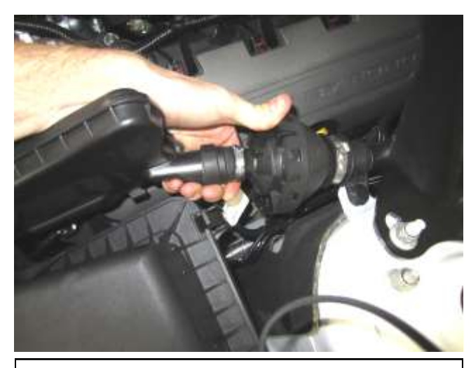
c. Disconnect the sound transfer tube where shown above by pulling the hose off or cutting off its clamp. Use the cap in the kit to cover the hole.