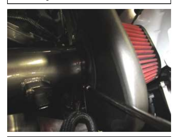
j. Slide filter clamp through the heat shield hole and tighten on the engine side of the shield ensuring that the clamp remains fully engaged on the filter.