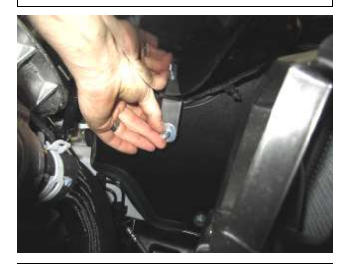
i. Install washer and nut on the bracket on the underside of the intake tube.