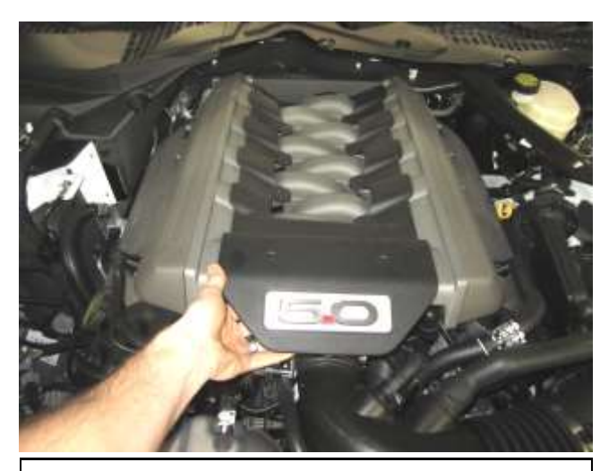
a. Lift up firmly on engine cover front and back to disengage and remove the engine cover.