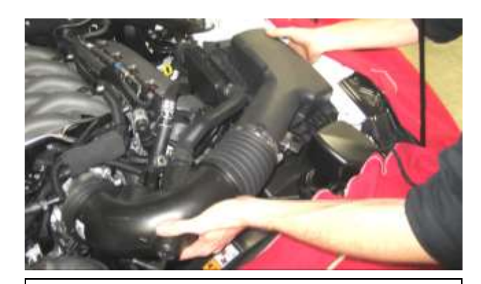
f. Pull the intake duct off the throttle body and lift out the factory intake assembly including the sound tube.