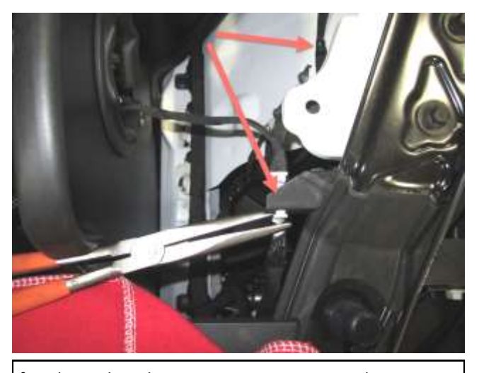
f. Release the other sensor wiring retaining clips. Pass the harness through the tube hole in the heat shield.