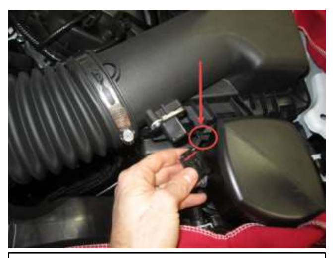
d. Disconnect MAF sensor wring and use needle nose pliers to pry the retaining clip out of the airbox (circled above). Remove the MAF sensor using the included TORX key and set aside.