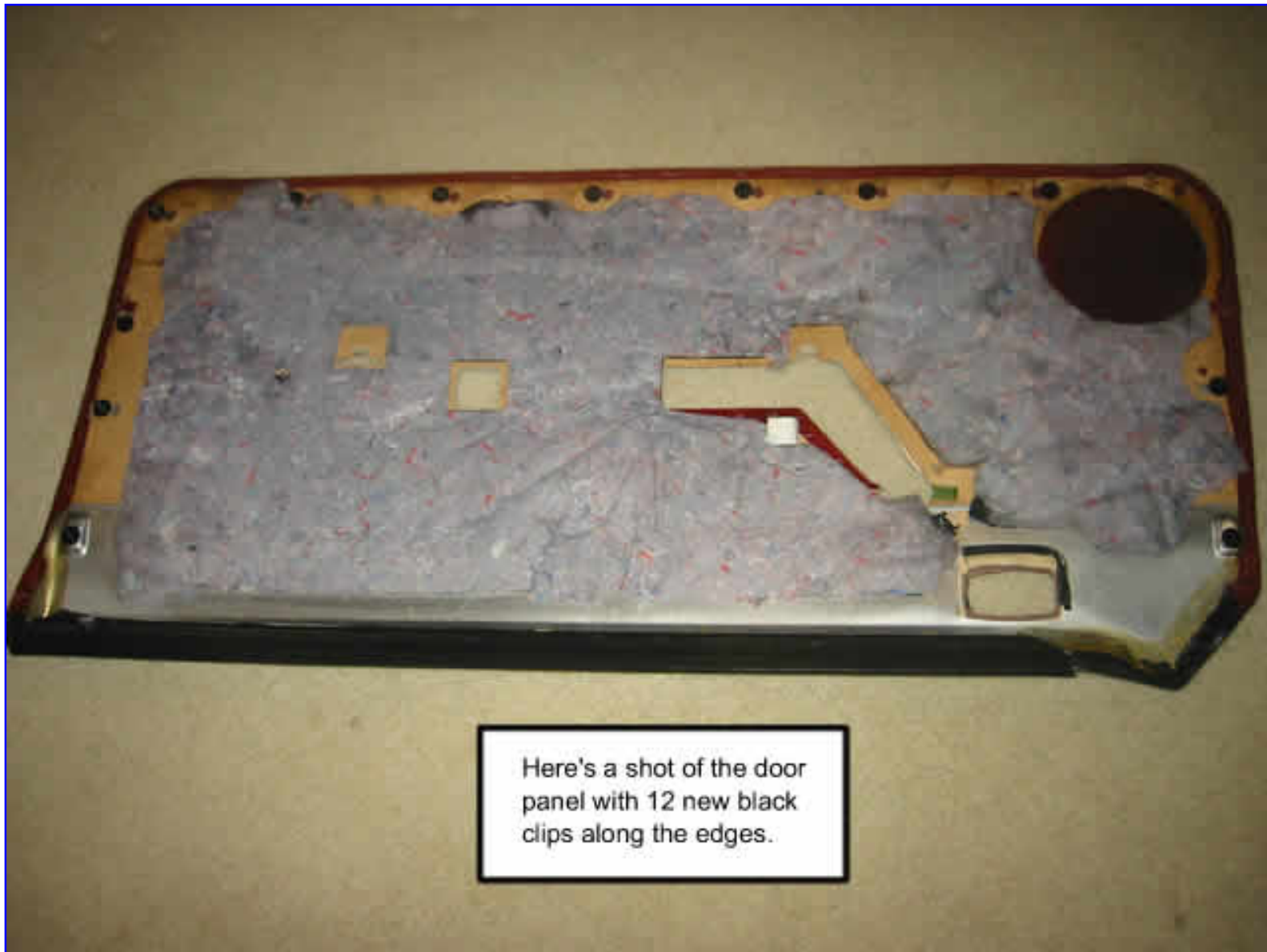
Here's a shot of the door panel with 12 new black clips along the edges.