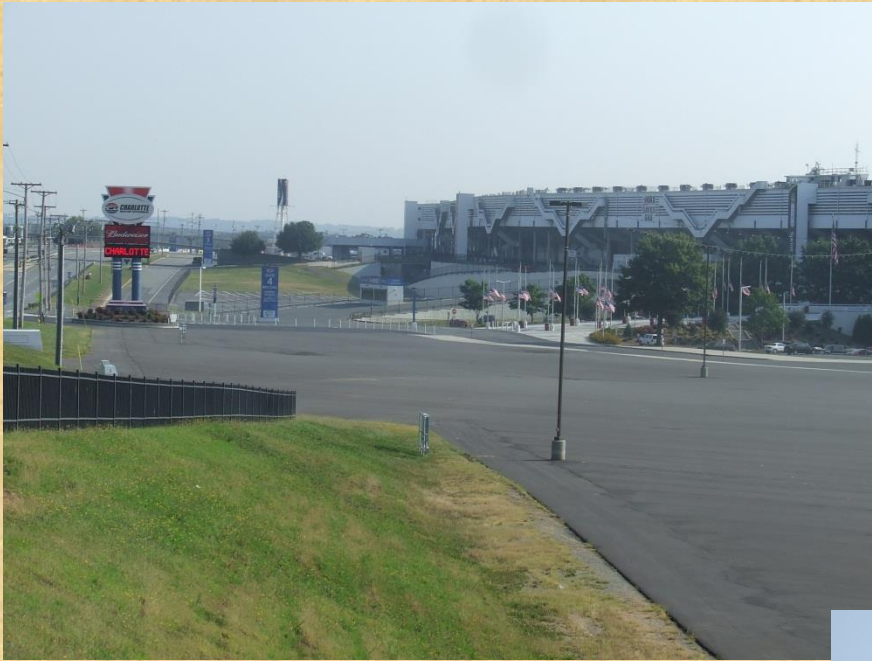
← Looking East