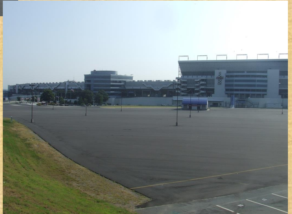
Looking Southeast →