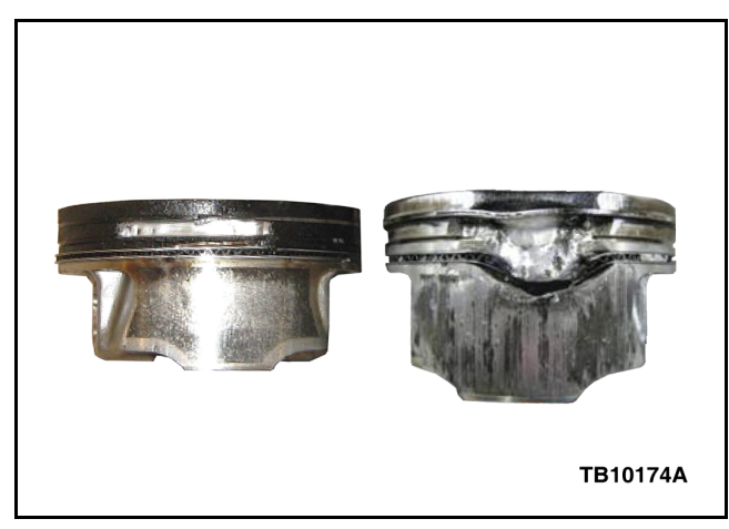
Figure 2 - Article 11-7-7