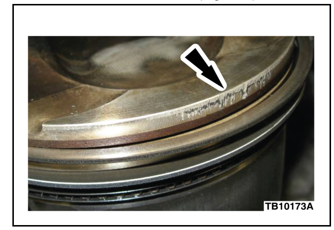
Figure 1 - Article 11-7-7